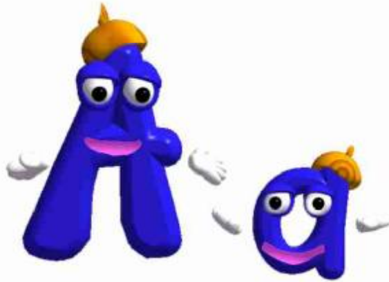
Auntie Allie A and Little Abbie a